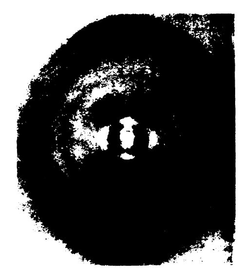
Fig. 1. Fibre diagram of deoxypentose nucleic acid from \emph{B. coli.} Fibre axis vertical

It may be shown<sup>5</sup> (also Stokes, unpublished) that the intensity distribution in the diffraction pattern of a series of points equally spaced along a helix is given by the squares of Bessel functions. A uniform continuous helix gives a series of layer lines of spacing corresponding to the helix pitch, the intensity distribution along the nth layer line being proportional to the square of J_n , the nth order Bessel function. A straight line may be drawn approximately through