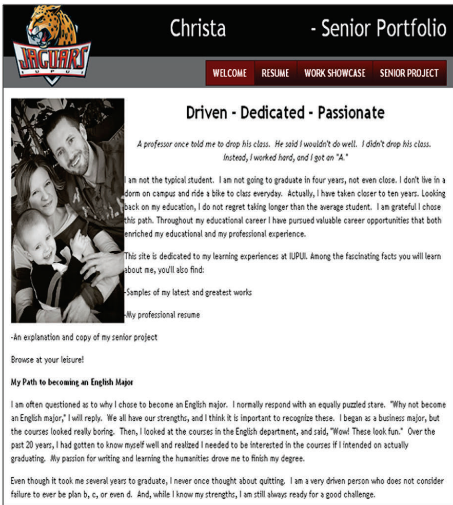
Figure 3. Webfolio Screen Shot 2.