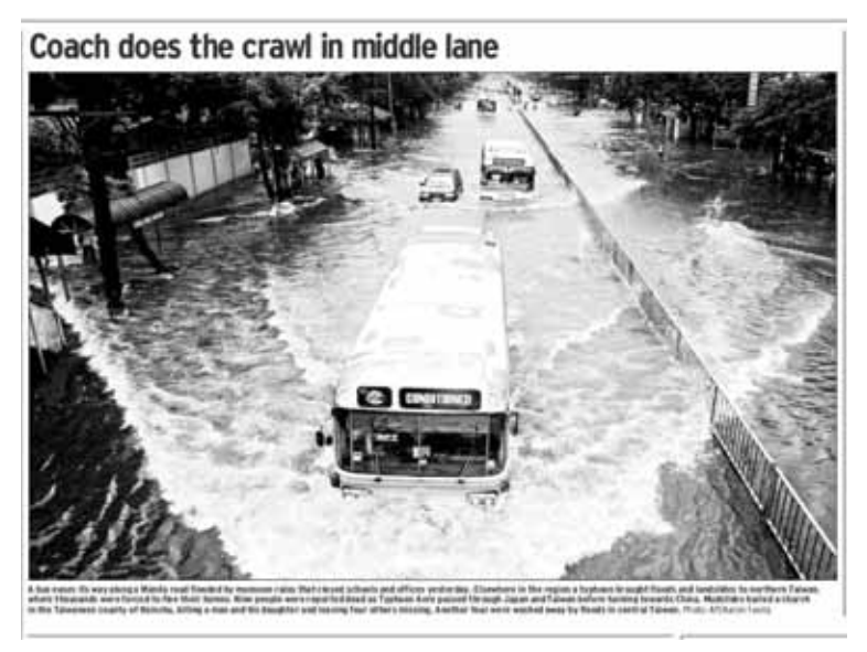
FIGURE 3: SYDNEY MORNING HERALD, 26/08/2004, P. 16

In the story in Figure 3, the heading makes reference to the sporting discourse of swimming, manipulating technical terminology such as (swimming) coach, the swim stroke front crawl and the marking out of the swimming pool into lanes, with the middle lane usually being the lane that the fastest swimmer will swim from in a competition. There is also another meaning that can be drawn from this heading and image in that given the dangerous conditions portrayed, the bus probably is driving along quite slowly. Thus we can also infer that the bus is carefully "crawling" along the street. The tone set up between heading and image is one established in play and humour. The caption, however, does not reflect this tone at all, and quickly moves into the destabilising nature of this event and the death and destruction that came with it. The caption reads: