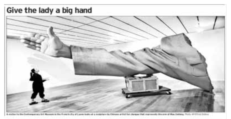
FIGURE 2: SYDNEY MORNING HERALD, 24/06/2004, P. 11

Since June 2004, I have systematically collected all image-nuclear news stories that have appeared in SMH , and my corpus currently stands at 1000 analysed stories. In the twelve months between June 2004 and June 2005 480 stories were presented as image-nuclear news stories. The average per month during this period was 40, with March 2005 having the highest number in any single month, which was 61. This meant that each day's edition had on average two such stories on the news pages. Of the 480 stories, 473 (98.5 per cent) made use of the heading and of those headings 440 (93 per cent) included an element of play between the heading and the image. It is to this notion of play that I would now like to turn.