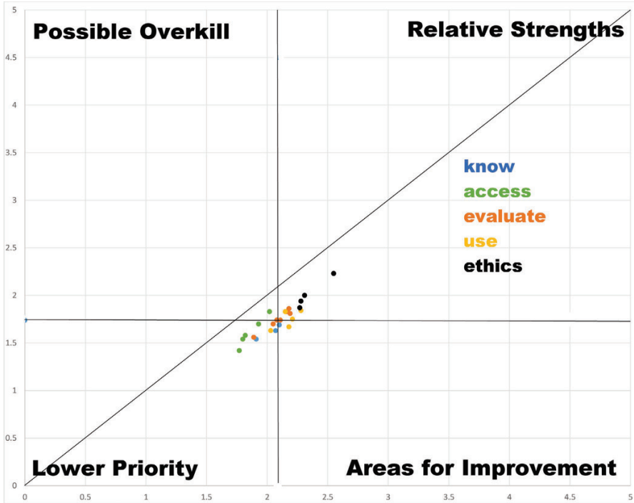
Figure 3.3. Plotted skill gap results.

employees are performing all skills below the diagonal, which represents a match between skills and expectations, but the gap is not large. Further, IL skills fall primarily in the relative strength and lower priority quadrants. That is, although all are lower than desired, those skills that are rated the lowest, generally falling in the area of information access, are also those least expected by employers. Meanwhile ethics skills, expected to be somewhat higher, are also observed to be somewhat higher.