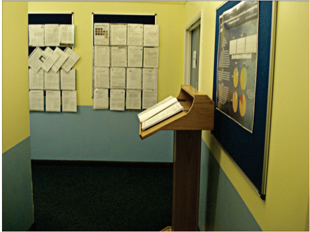
Figure 10.2: Photo 2.

plastic pockets, five across, three down. On one side a lectern facing the wall holds a thick file of journal articles. Flicking through, the thud of each article and weight of research and publication.