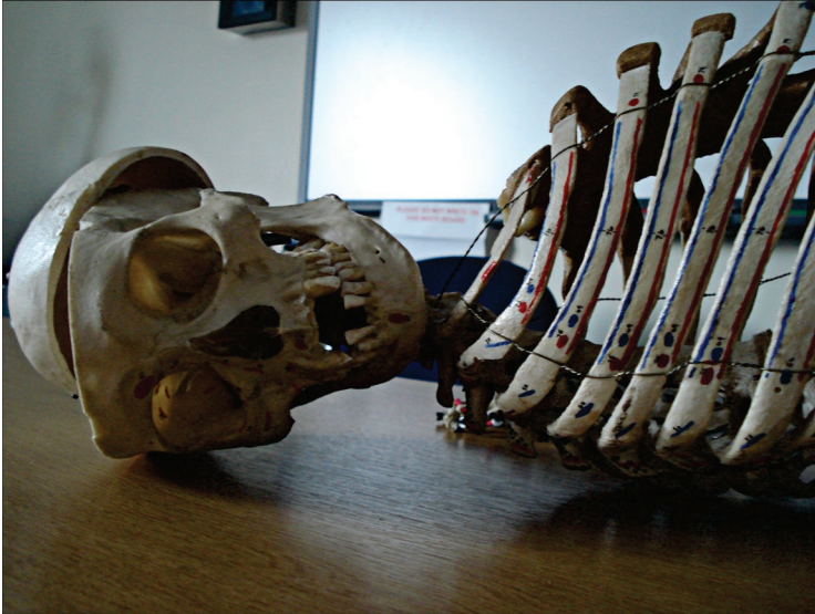
Figure 10.6: Photo 6.