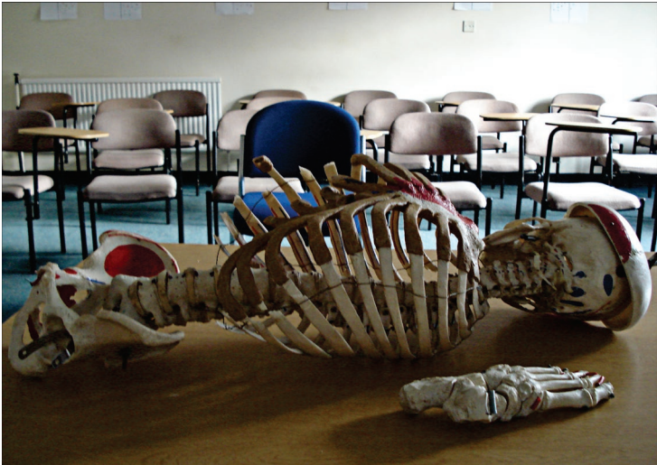
Figure 10.5: Photo 5.