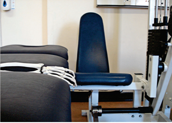
Figure 10.4: Photo 4.

theme continues in the classroom, a disarticulated skeleton without limbs asleep on the desk, a loose foot lying by its head, with painted markings, caveman-like. The skull lies with its cheek on the desk, the cranium to one side, a vanitas without clock or book.