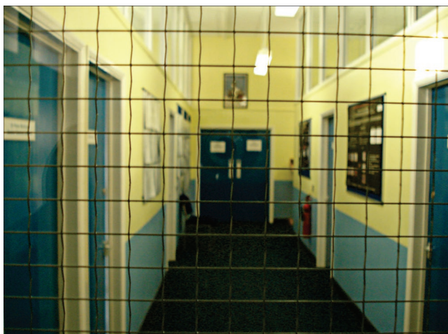
Figure 10.1: Photo 1.

Following the signs, trying to navigate the sections and subsections of the Mile End hospital, a collection of workaday modernist and Victorian sanatorium architectures, I find the back stairs to the Sports Medicine Clinical Assessment Service. At the end of a blue and magnolia corridor of closed doors, each with nameplate and title, are two large notice boards with rows of journal articles pinned up in