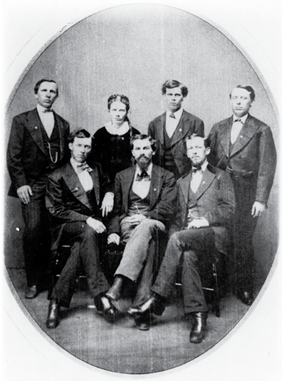
Figure 1. The Ohio University Class of 1873.

a college student when she produced it, she discusses her rhetorical education in it, and she viewed the diary as a record of her writing progress. For her first