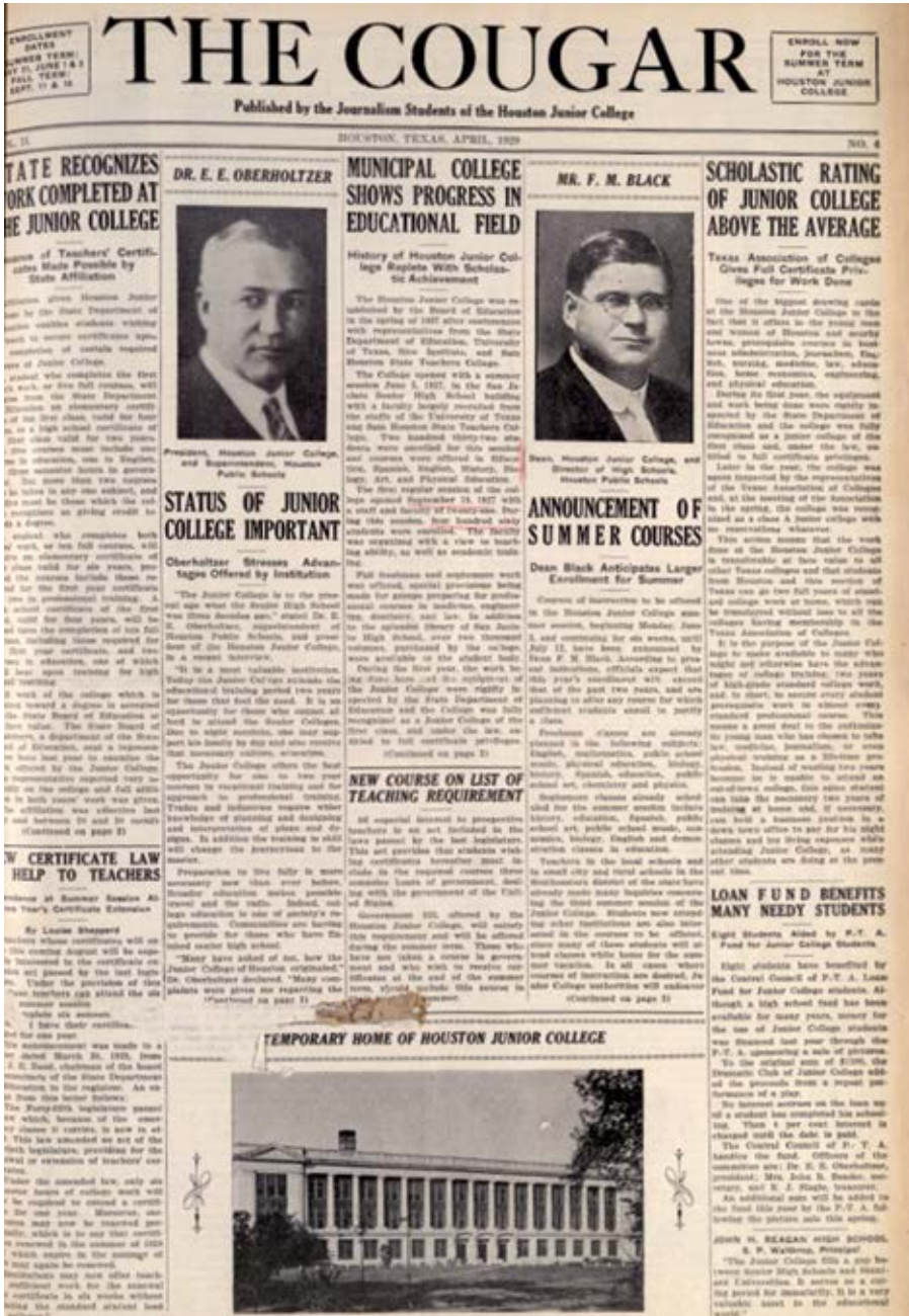
Figure 2. The Cougar, April 1929.