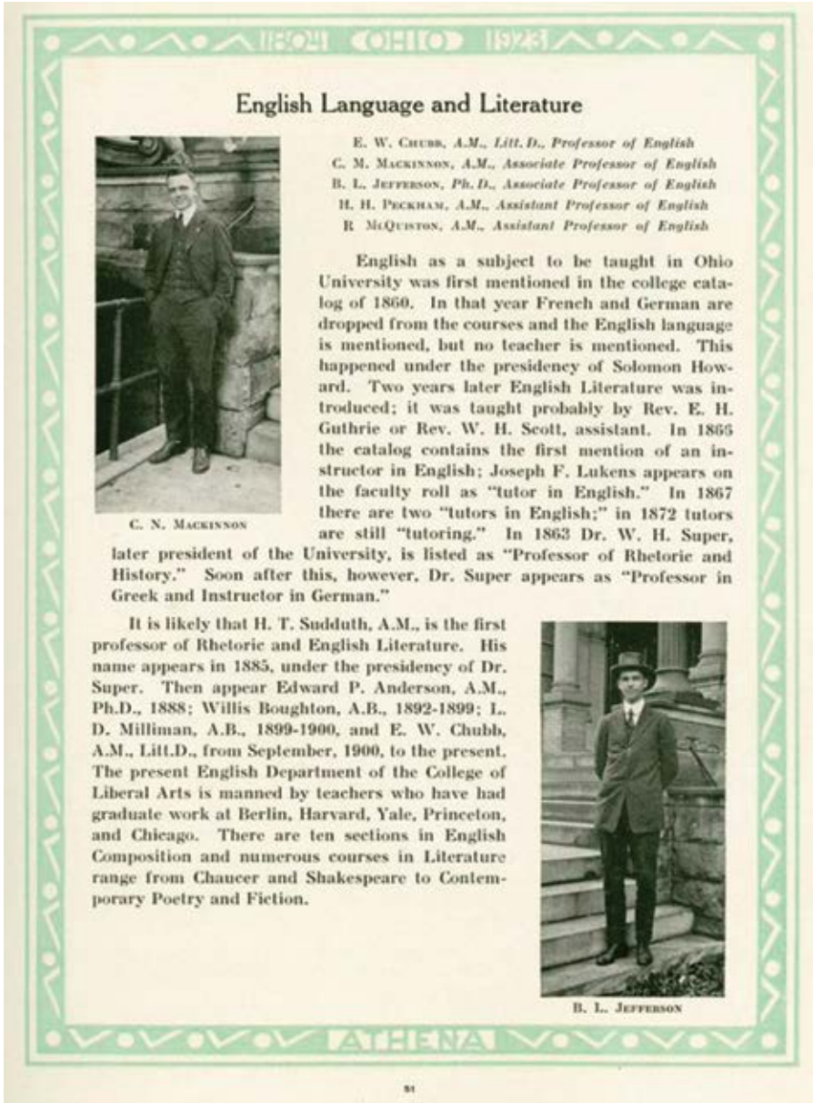
Figure 5. English Department of the Ohio University College of Liberal Arts, Athena, 1923.

“creative and critical writing” ( Ohio University Bulletin , 1925-1926 164). Also, College of Education students who took the course Teaching of Language in