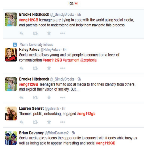
Figure 14.1: Students' Tweets to a Designated Hashtag.

In the spring 2015 semester, I was teaching a second-semester writing course focused on the rhetoric and culture of social media. In one class, students were asked to tweet their initial analysis of a chapter by danah boyd (2014). In order to protect both my and students' privacy while using Twitter, I created the hashtag #eng112GB (the course code, number, and section). By creating this hashtag, neither students nor I had to follow each other. Students got in groups, discussed the assigned chapter, and tweeted to the designated hashtag as seen in Figure 14.1. After they finished tweeting, I pulled up the Twitter feed on the screen as a springboard for a whole-class discussion of the chapter.