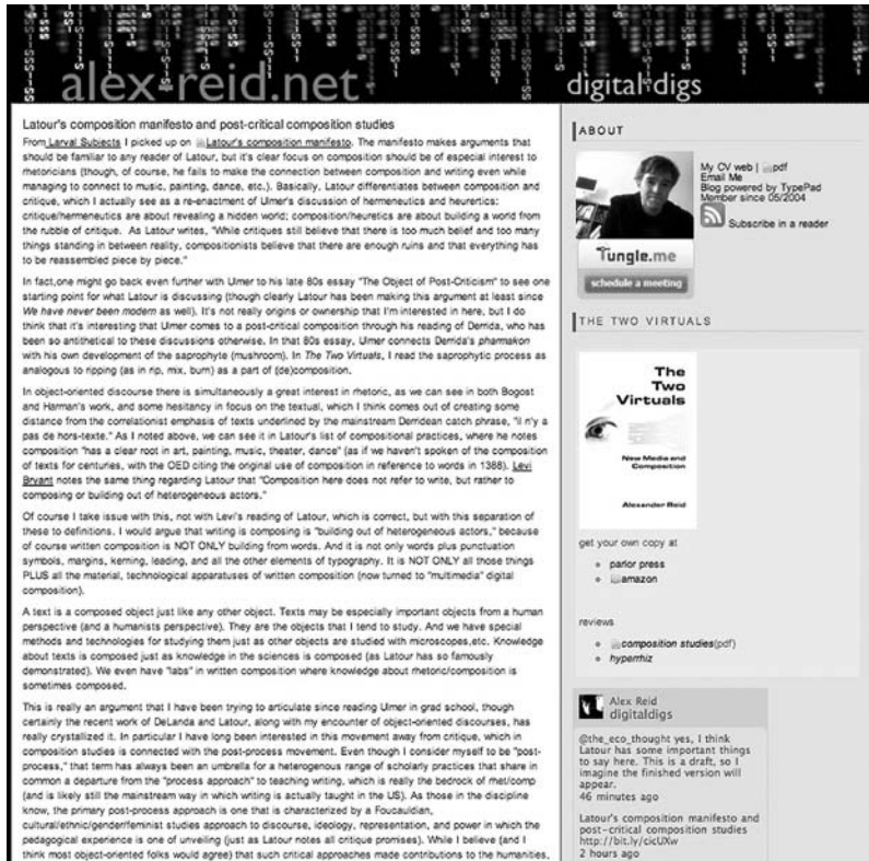
Fig. 1. A screen capture of my current blog, www.alex-reid.net .