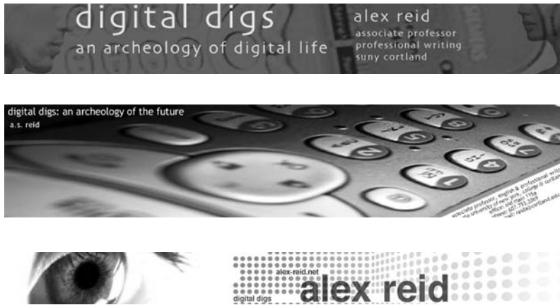
Figs. 2–6. Examples of different banners I have used for my blog.

used dark text on a light background. You should experiment with font, font size, and spacing. Because my posts tend to be long, I have emphasized readability by selecting a simple font and adding some additional spacing between the lines (i.e., more than single-spaced).