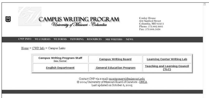
Figure 4: University of Missouri Campus Writing Program Campus Links http://cwp.missouri.edu/cwpinfo/campuslinks.htm

A unique feature of a website published on the Internet is how quickly it can connect to a national and even international audience: I connected the CSUS WAC website to a broader audience beyond campus by including it in the WAC Clearinghouse’s list of links to programs as well as the National Network of Writing Across the Curriculum’s list of programs and their websites. You can also find my WAC program through a Google search using key terms like “writing across the curriculum,” and over time it has joined a kind of WAC web ring of programs: one of the websites I am using as a model, the University of Missouri at Columbia Campus Writing Program, has a link to the CSUS WAC website as well as the other websites I am using as models in this essay. Although it’s difficult to gauge just how often audiences beyond campus are visiting the CSUS WAC website, a number of institutions, from Alaska to New York, have